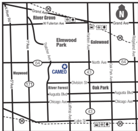
River Forest: 7603 West North Avenue, T: (708) 456-7787