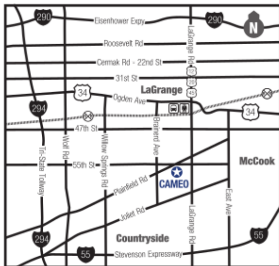
LaGrange: 475 West 55th Street, Suite #208, T: (708) 579-0488