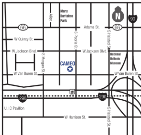
Chicago: 910 W. Van Buren, Suite #600, T: (312) 201-4141